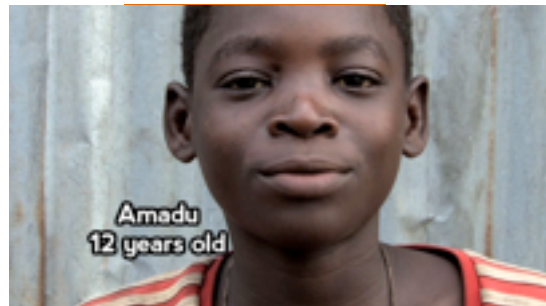
Film for Street Child

And we supported Street Child's London sleep out by making the film for their Big Night Out event. Check the film here.