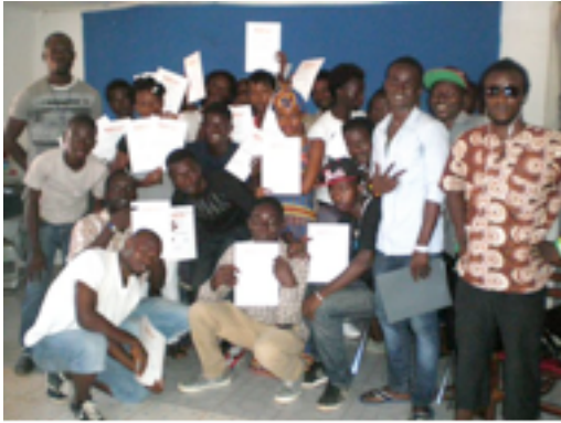
WAYout students receiving certificates

Anyone who gets three certificates in any category, gets 100,000L (about £15). Street youth are not used to obeying deadlines and schedules and we find the certificate scheme acts as an incentive to finish projects and attend regularly and on time. In the 7 months between July 13 and February 14, 125 certificates were awarded to 74 people. We also have a small grants scheme for people who attend regularly. They can apply for support finding a home, literacy classes, repatriation or medical treatment.