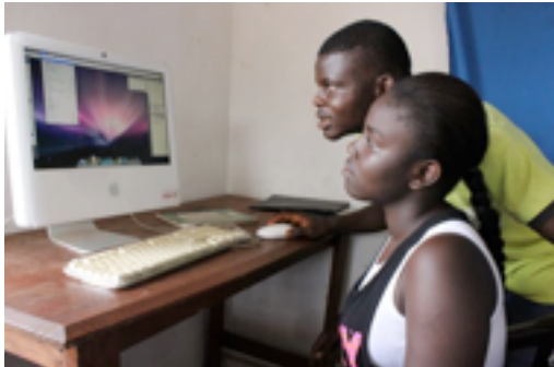
New iMacs donated by Crisis

- Strummerville - who this year raised the funding to pay our studio engineers and producers.